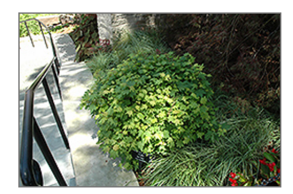
W.B. Hoyt Vine Maple

W.B. Hoyt Vine Maple will grow to be about 6 feet tall at maturity, with a spread of 6 feet. It has a low canopy, and is suitable for planting under power lines. It grows at a slow rate, and under ideal conditions can be expected to live for 60 years or more.