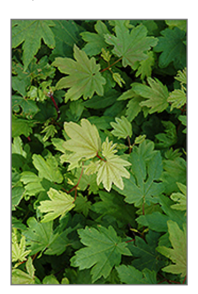
W.B. Hoyt Vine Maple foliage