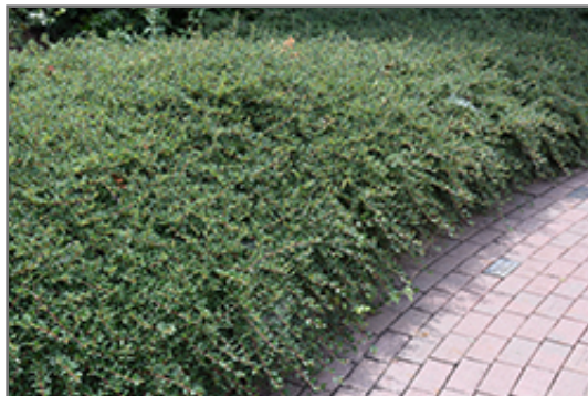
Coral Beauty Cotoneaster