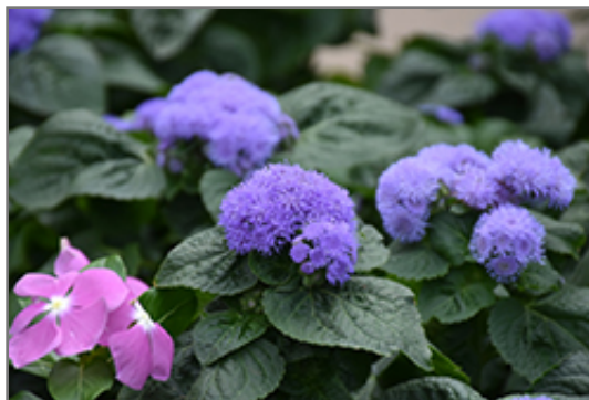
High Tide Blue Flossflower flowers