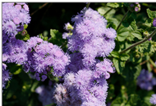
Blue Horizon Flossflower flowers

Blue Horizon Flossflower is recommended for the following landscape applications;