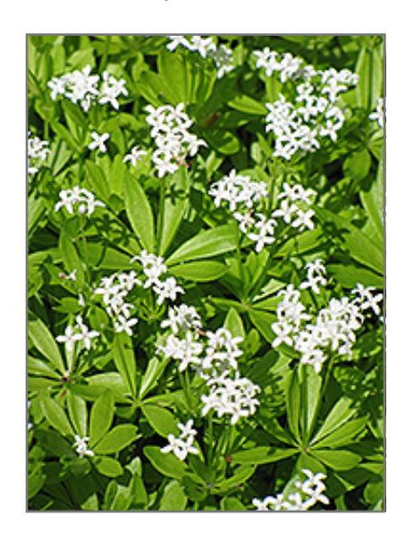
Sweet Woodruff flowers