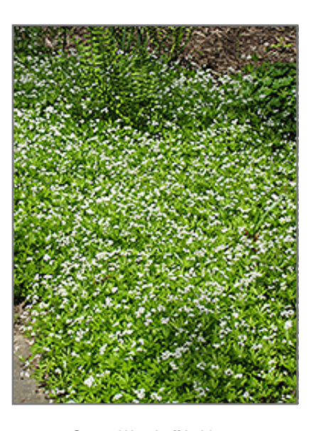
Sweet Woodruff in bloom