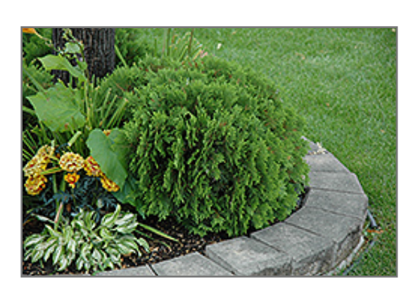
Danica Arborvitae

A truly dwarf globe-shaped evergreen shrub, very slow growing, as small as they come, at least for this species; excellent for garden detail use and for rock gardens; hardy and adaptable, best with adequate sun, protect from drying winds