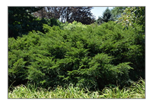
Runyan Yew

This is a relatively low maintenance shrub, and can be pruned at anytime. It has no significant negative characteristics.