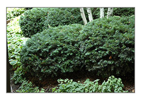
Runyan Yew

Runyan Yew is a dense multi-stemmed evergreen shrub with a ground-hugging habit of growth. Its relatively fine texture sets it apart from other landscape plants with less refined foliage.