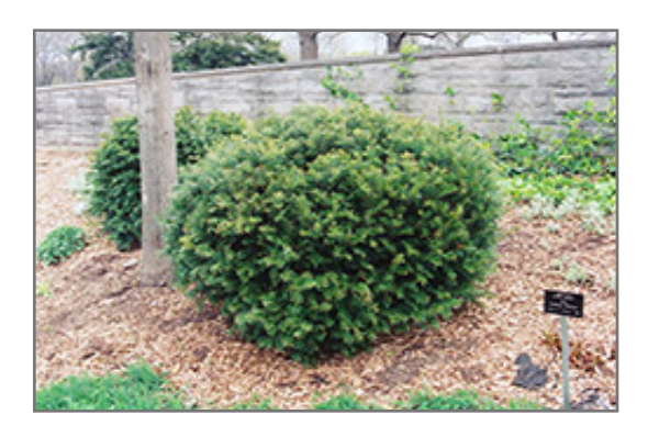
Brown's Yew

A versatile evergreen garden shrub with an upright wide-spreading habit, bright green emerging foliage is striking against dark green needles in spring; a superb screening or foundation shrub, takes pruning very well, does well in shade