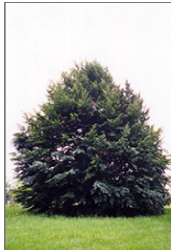
European Beech