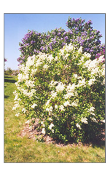
Primrose Lilac in bloom

A stunning spring blooming lilac featuring intensely fragrant lemon yellow flowers in upright panicles; upright, multi-stemmed habit, very hardy, tends to sucker, ideal for screening; full sun and well-drained soil, allow room for air movement