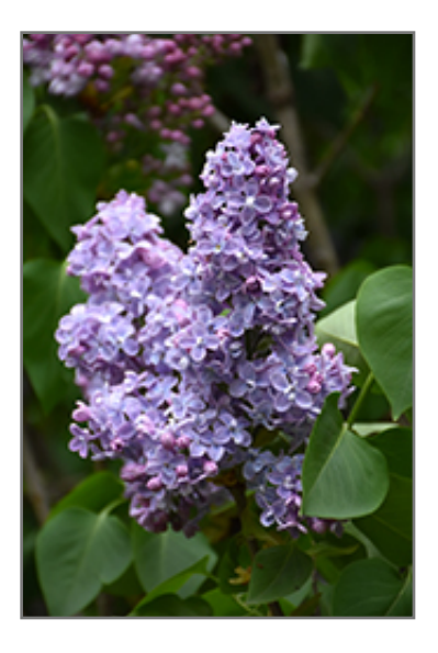
President Grevy Lilac flowers

This classic spring blooming French hybrid features exquisitely scented double blue flowers in upright panicles; upright, multi-stemmed habit, very hardy, tends to sucker, ideal for screening; full sun and well-drained soil, allow room for air movement