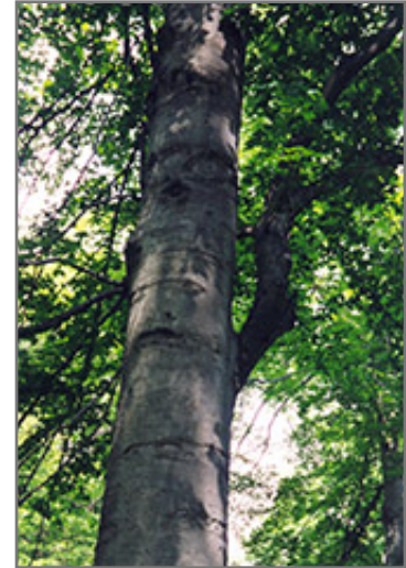
American Beech bark

This tree should only be grown in full sunlight. It requires an evenly moist well-drained soil for optimal growth, but will die in standing water. It is not particular as to soil pH, but grows best in rich soils. It is quite intolerant of urban pollution, therefore inner city or urban streetside plantings are best avoided, and will benefit from being planted in a relatively sheltered location. This species is native to parts of North America.