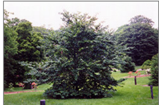
American Beech