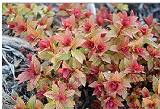
Magic Carpet Spirea foliage