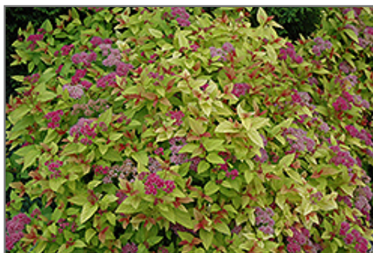
Magic Carpet Spirea flowers