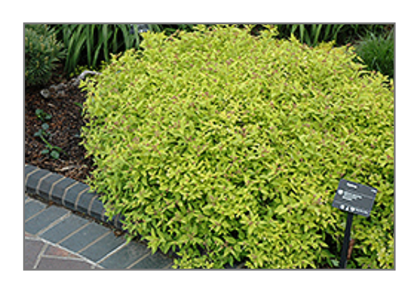
Limemound Spirea

A beautiful shrub for color effect in the garden, with shimmering lime-green foliage which emerges bronze, turning red in fall, and flat-topped clusters of pink flowers in early summer; forms a dense, compact ball, neat and tidy