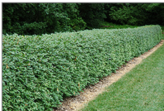
Winged Burning Bush