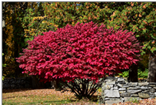
Winged Burning Bush in fall