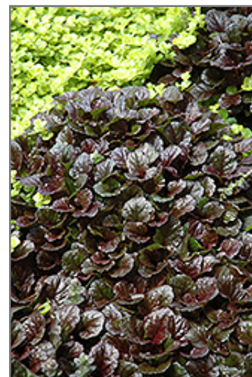
Black Scallop Bugleweed