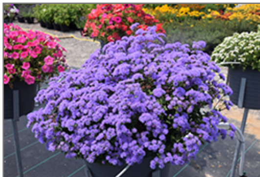
Artist Blue Flossflower in bloom