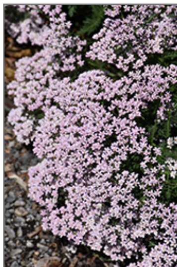
Lavender Deb Yarrow flowers