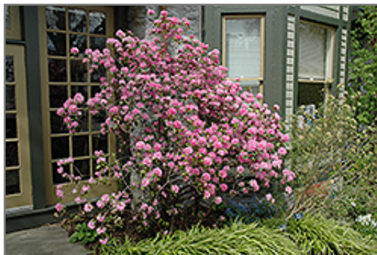
Olga Mezitt Rhododendron in bloom