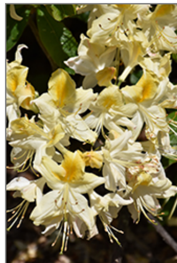
Northern Hi-Lights Azalea flowers