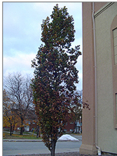
Pyramidal English Oak in fall