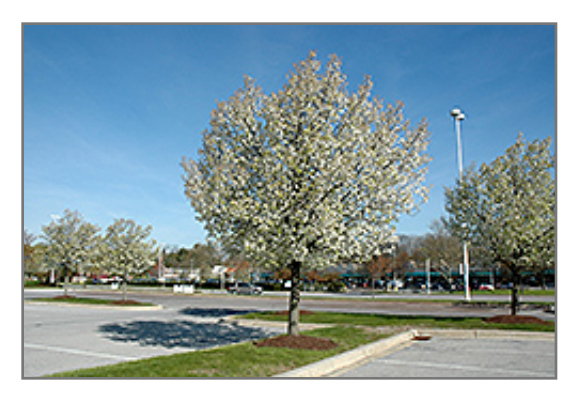
Autumn Blaze Ornamental Pear in bloom

Autumn Blaze Ornamental Pear is recommended for the following landscape applications;