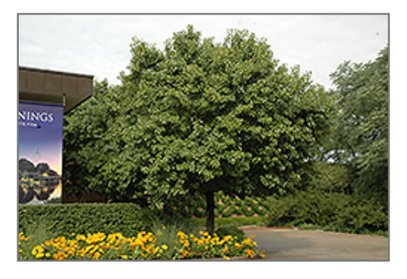
Autumn Blaze Ornamental Pear