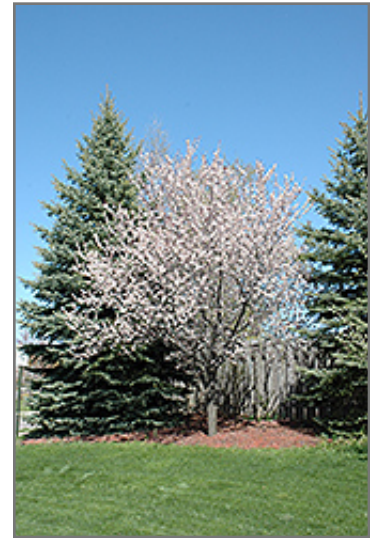
Newport Plum in bloom

This tree should only be grown in full sunlight. It does best in average to evenly moist conditions, but will not tolerate standing water. It is not particular as to soil type or pH. It is highly tolerant of urban pollution and will even thrive in inner city environments. This is a selected variety of a species not originally from North America.