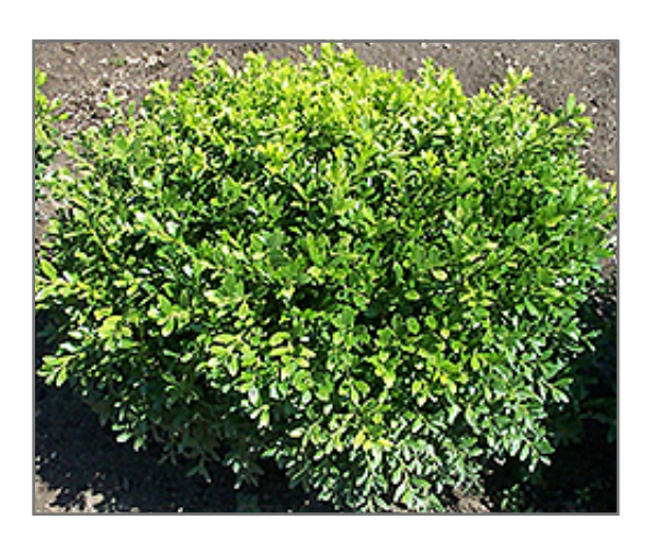
Antarctica Boxwood

Dense dark green foliage on a slow growing, small, rounded, and compact shrub; it takes little work to keep its shape and is excellent for low hedges or detail use in the garden, takes pruning exceptionally well