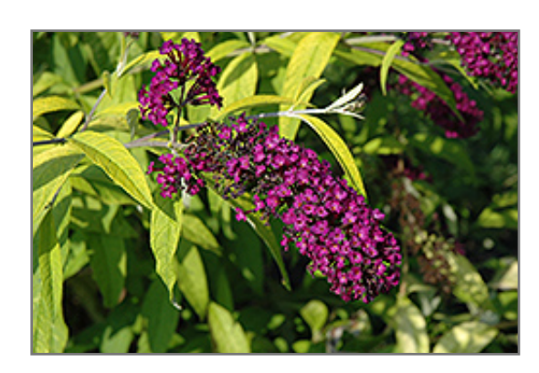
Santana Butterfly Bush flowers

A variety with variegated foliage and fragrant purple-red flowers all summer long; attracts butterflies; may treat as a perennial and cut it back to the ground each spring as it regrows vigorously and blooms on new wood