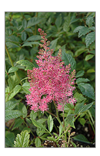
Astary Rose Astilbe flowers

Lovely soft pink plumes rising above a compact mound of foliage; perfect in a shady spot with dappled light; prefers moisture so water regularly for abundant flowers and nice foliage