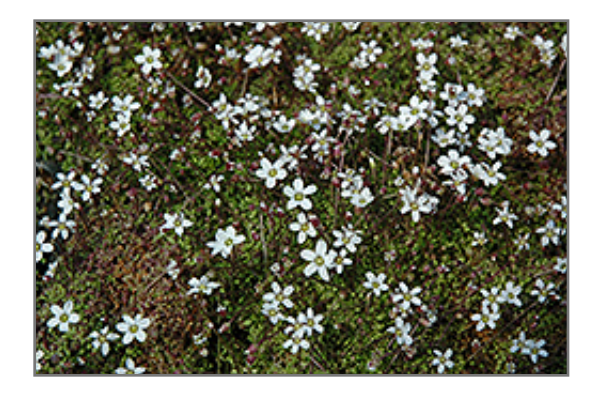
Corsican Sandwort flowers

An interesting little alpine or rock garden plant which forms a low evergreen cushion of dark green foliage; bears loads of tiny white flowers on short stems in late spring; great for edging paths, between flagstones, or in the rock garden