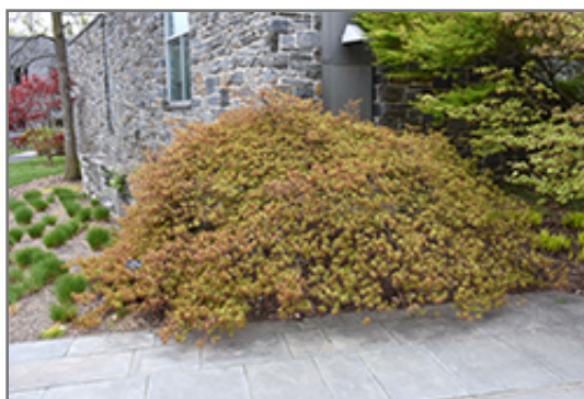
Spring Delight Japanese Maple