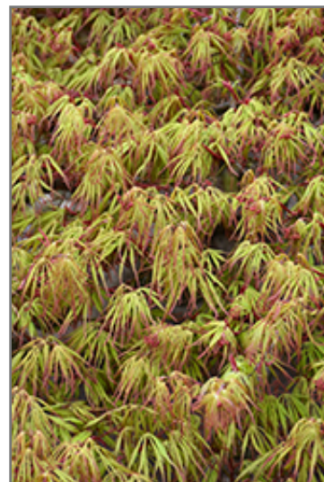
Spring Delight Japanese Maple foliage