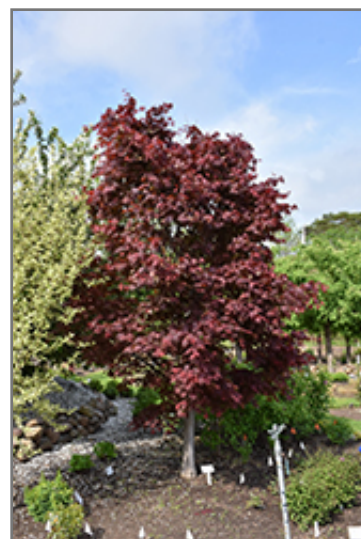
Samurai Sword Japanese Maple