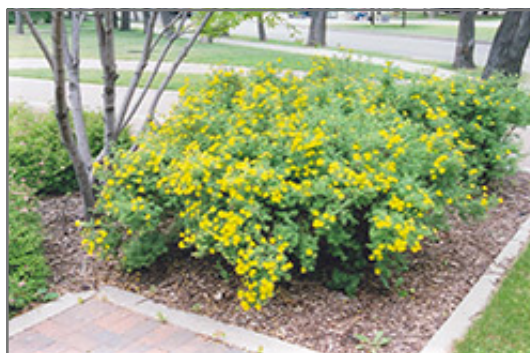
Coronation Triumph Potentilla in bloom