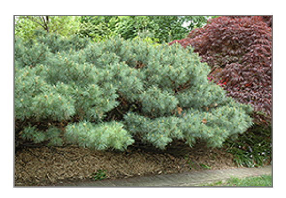
Dwarf White Pine

A high quality evergreen garden shrub with a dense, rounded habit of growth throughout its life, features silvery-blue needles; very compact and slow growing, excellent for form, texture and color detail in home gardens or for rock gardens; needs full sun