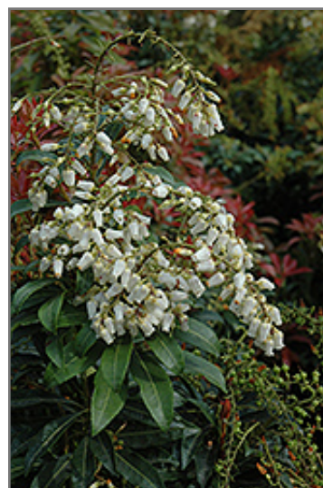
Mountain Fire Japanese Pieris flowers