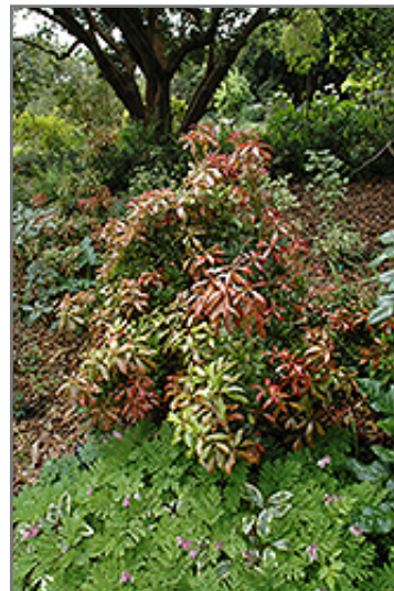
Mountain Fire Japanese Pieris

* This is a 'special order' plant - contact store for details