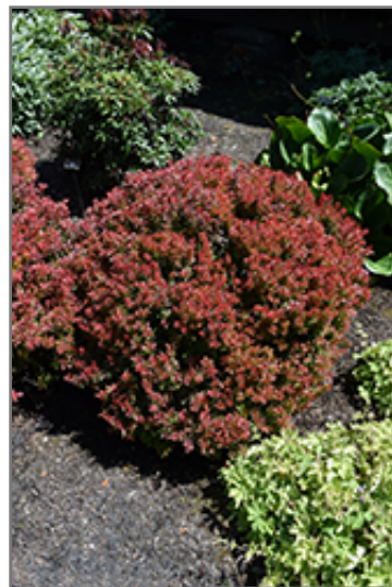
Golden Ruby Barberry