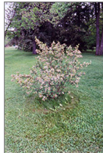
Black Chokeberry in bloom