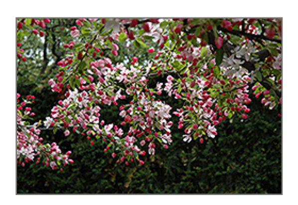
Redbud Crabapple flowers