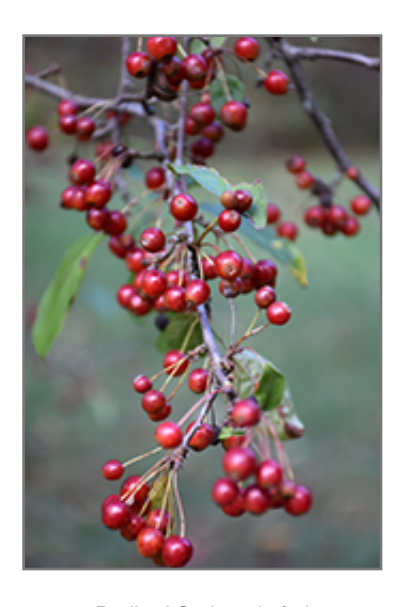
Redbud Crabapple fruit

This tree should only be grown in full sunlight. It prefers to grow in average to moist conditions, and shouldn't be allowed to dry out. It is not particular as to soil type or pH. It is highly tolerant of urban pollution and will even thrive in inner city environments. This particular variety is an interspecific hybrid.