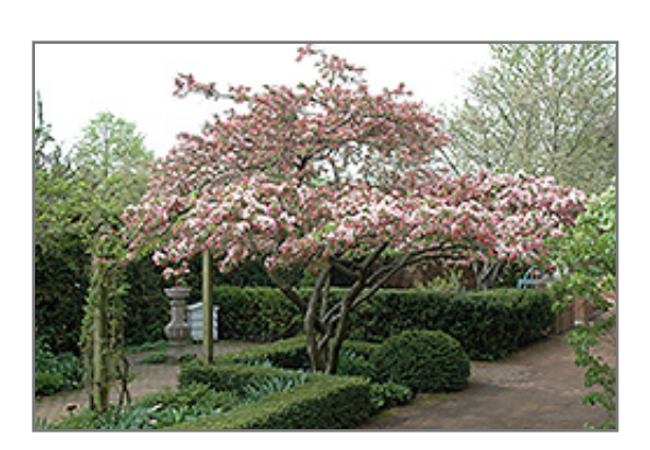
Redbud Crabapple in bloom

Redbud Crabapple is recommended for the following landscape applications;