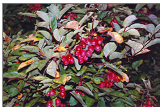
Adams Flowering Crab fruit