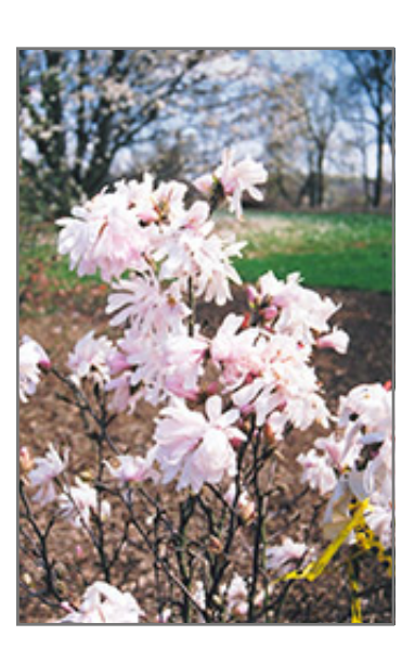
Centennial Magnolia flowers

Centennial Magnolia is clothed in stunning fragrant double white star-shaped flowers with yellow eyes and shell pink edges at the ends of the branches in early spring before the leaves. It has dark green deciduous foliage. The pointy leaves turn coppery-bronze in fall. The fruits are showy pink pods displayed in early fall.