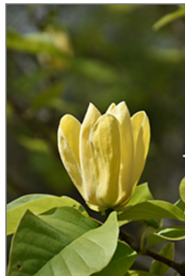
Yellow Bird Magnolia flowers

Yellow Bird Magnolia will grow to be about 40 feet tall at maturity, with a spread of 30 feet. It has a low canopy with a typical clearance of 5 feet from the ground, and should not be planted underneath power lines. It grows at a medium rate, and under ideal conditions can be expected to live for 80 years or more.