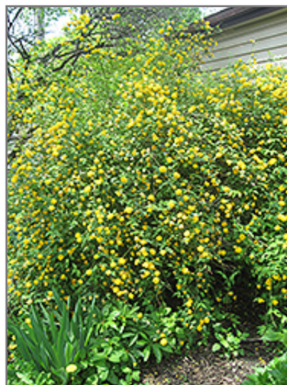
Double Flowered Japanese Kerria