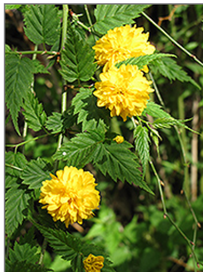
Double Flowered Japanese Kerria flowers

Double Flowered Japanese Kerria is recommended for the following landscape applications;