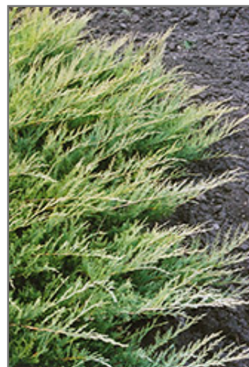
Broadmoor Juniper foliage