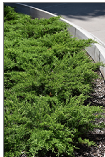
Broadmoor Juniper

Broadmoor Juniper will grow to be about 24 inches tall at maturity, with a spread of 8 feet. It tends to fill out right to the ground and therefore doesn't necessarily require facer plants in front. It grows at a slow rate, and under ideal conditions can be expected to live for approximately 30 years.