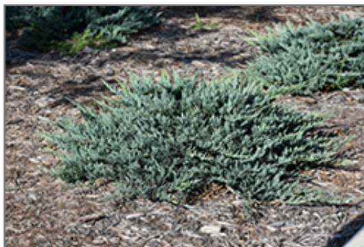
Blue Chip Juniper