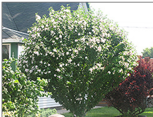
Morning Star Rose of Sharon in bloom

Morning Star Rose of Sharon is recommended for the following landscape applications;