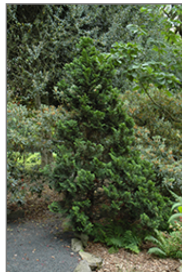
Nana Dwarf Hinoki Falsecypress