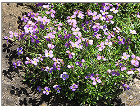
Dwarf Rock Cress in bloom