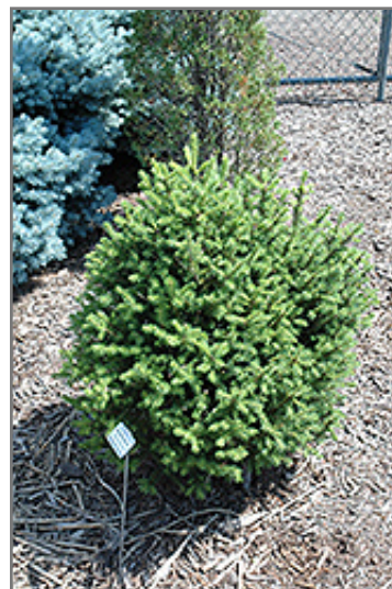
Sherwood Compact Norway Spruce