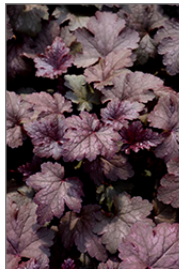
Amethyst Mist Coral Bells foliage

Amethyst Mist Coral Bells is recommended for the following landscape applications;