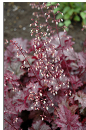
Amethyst Mist Coral Bells flowers