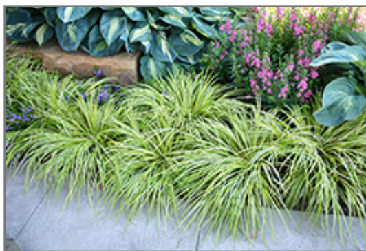
Grassy-Leaved Sweet Flag