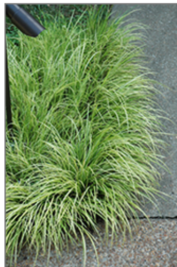
Grassy-Leaved Sweet Flag

Grassy-Leaved Sweet Flag is a fine choice for the garden, but it is also a good selection for planting in outdoor pots and containers. It is often used as a 'filler' in the 'spiller-thriller-filler' container combination, providing a canvas of foliage against which the larger thriller plants stand out. Note that when growing plants in outdoor containers and baskets, they may require more frequent waterings than they would in the yard or garden.