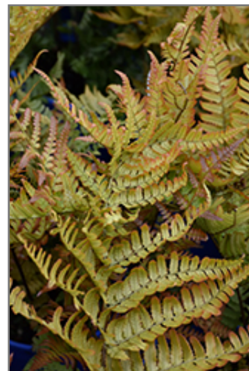
Brilliance Autumn Fern foliage