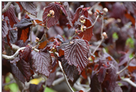
Red Majestic Corkscrew Hazelnut foliage

This shrub does best in full sun to partial shade. It is very adaptable to both dry and moist locations, and should do just fine under average home landscape conditions. It is not particular as to soil type or pH. It is highly tolerant of urban pollution and will even thrive in inner city environments. This is a selected variety of a species not originally from North America.