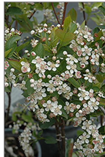
Viking Chokeberry flowers