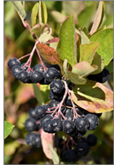
Viking Chokeberry fruit

This shrub should only be grown in full sunlight. It is an amazingly adaptable plant, tolerating both dry conditions and even some standing water. It is not particular as to soil type or pH, and is able to handle environmental salt. It is somewhat tolerant of urban pollution. This particular variety is an interspecific hybrid.